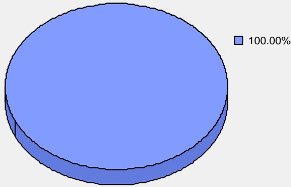
Total Breakdown of percentage by year for Mill Codes