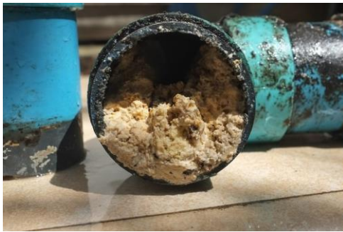
Pipe clogged with grease

In Onoway like in many other Jurisdictions, the costs associated with the maintenance and repair of the wastewater (sewer) system are calculated in to our utility rate which is then paid by you the users. When the cost of maintenance and repair goes up the utility rate goes up. For example, we plan to desludge our lagoon approximately every five years. Due to high levels of sludge containing items in the above mentioned list our cost for desludging this year has increased, and we will have to modify our desludging program from approximately every five years to approximately every three years to ensure our system is working to treat the effluent as designed. Ensuring that we are operating as designed helps to ensure we are compliant with Federal and Provincial regulators.