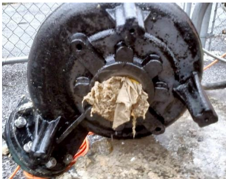
Pump clogged with wipes and feminine hygiene